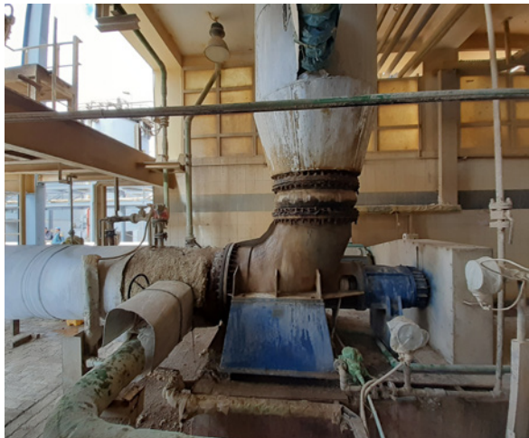
Evaporator circulation pump type CAHRM750K running at site (2020).

The pump was operated for eight years without any repair. After that, the customer decided to replace the main wear parts: propeller, shaft, wear ring and mechanical seals. Although many of the parts could have been re-used, the customer chose to replace them with genuine new parts. Reusing worn components would not have guaranteed a similar lifetime after restart.